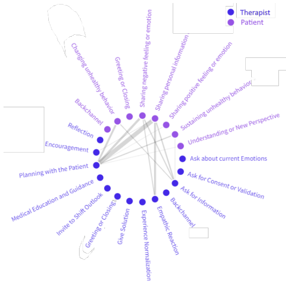
Figure 1: Local (therapist DA to patient DA) patterns in the HOPE dataset.

A pattern is a sequence of dialog acts that appear at least twice in the dataset. The width of the lines is proportional to the number of occurrences of the patterns in the dataset.