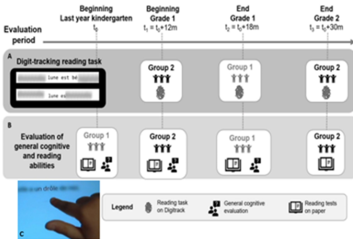
Fig. 3. Experimental procedure. (A) An example of digit-tracking reading task (upper left) assigned to Group 1 at the end of Grade 1 ( t_2 ) and to Group 2 (black) at two time points: the beginning of first grade ( t_1 ) and at the end of second grade ( t_3 ). Written texts were presented either in large unblurring window (black box, upper line) or small window (black box, lower line). (B) Children's general cognitive abilities were assessed at pre-test ( t_0 for Group 1 and t_1 for Group 2, except for digit-span, (see part 2.2.)). General cognitive abilities) and their reading skills were assessed on paper at post-test ( t_2 for Group 1 and t_3 for Group 2). C. Example of a child unblurring the text using digit-tracking in the small window condition (the large window is twice as larger in length).

For Group 1, 19 children (Fig. 3) took part in the study at the beginning of their last year of kindergarten ( t_0 , pre-test phase) in November-December 2019 for general cognitive evaluations (Table 3); and at the end of their