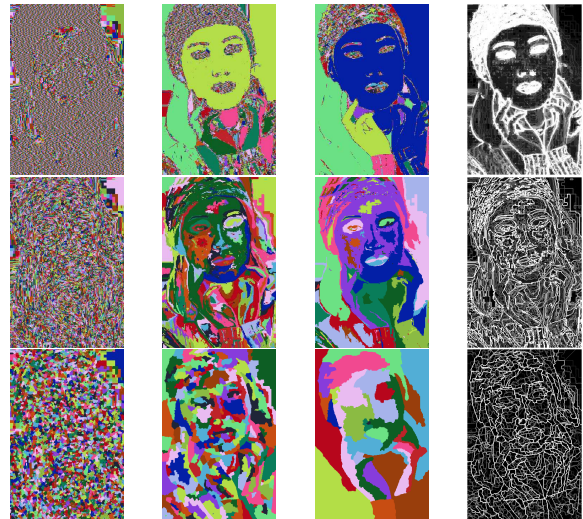
Figure 1: Hierarchies of partitions by quasi flat zones (top), homogeneous connections (middle) and waterfall (bottom). Depicted partitions correspond the levels 1, 5, 10 and the last column presents the saliency maps of the produced hierarchies over ten levels.

Partitions obtained from any connective criterion, provide, in the low levels, over-segmented partitions called fine partitions. These fine partitions are interesting for image simplification because they can be used as markers for connective filters such as levellings [6]. However they have another strong interest. Hierarchies of partitions, such as irregular pyramids [7], usually use very simple fine partitions as the lowest level of the pyramid, namely each pixel is a region. It is totally useless to proceed in such a way since it makes the hierarchical structure bigger by including evident mergings at the lowest levels. Moreover the pixel grid is not a natural representation of visual scenes. It is much more natural, and presumably more efficient, to work with perceptually meaningful entities obtained from a low-level grouping process. To build a hierarchy of partitions, one thus might use a fine segmentation, obtained from any connective criterion, as the base of the pyramid. In this paper we are interested in building such hierarchies.