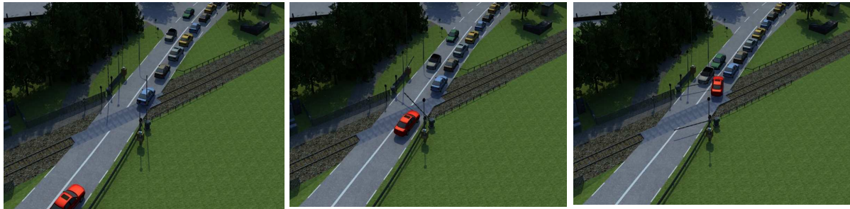
Fig. 5 : Scenario with a car blocked on the level crossing behind a line of vehicles