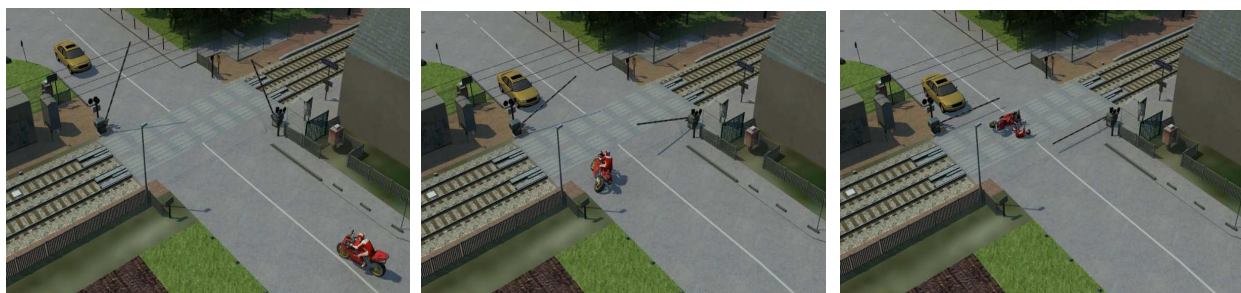
Fig. 4 : Scenario with a two-wheeled vehicle that falls on the level crossing

Several scenarios are envisaged in the project. To show the interest of the simulation platform, two scenarios are considered in this paper. In the first one (cf. Fig. 4), a two-wheeled vehicle moves towards a level crossing with a speed of 70 km/h (Fig. 4-left). The traffic light indicates the arrival of a train and the barriers start lowering. The two-wheeled vehicle decides to slalom between the barriers (Fig. 4-middle). Then, he loses the grip of his vehicle and falls on the railway, while the train is approaching closely the level crossing (Fig. 4-right). In the second scenario, a car moves towards a level crossing (Fig. 5-left). Engaged to cross the level crossing behind a line of vehicles, the car moves with stop&go maneuvers, while the barriers start lowering indicating the arrival of a train (Fig. 5-middle). The car is then blocked on the railway without any possibility to leave the lane (Fig. 5-right).