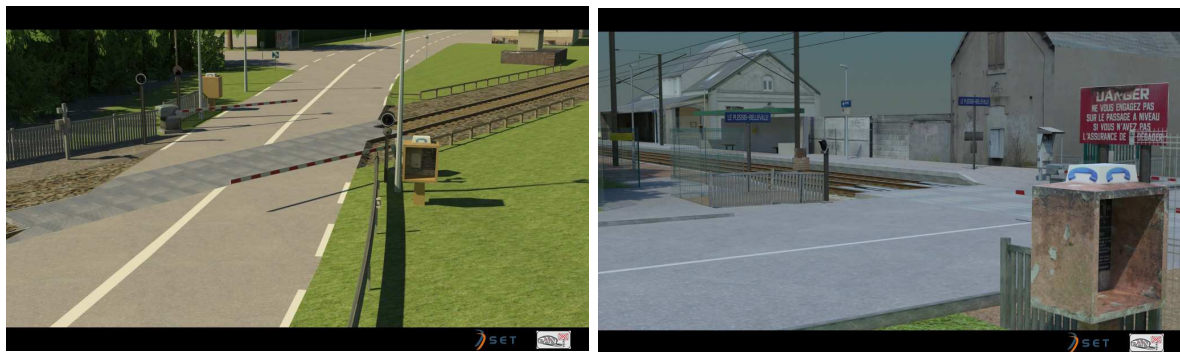
Fig. 3: Example of modeled level crossings

In the framework of the PANsafer Project, the universe 3D modeling focuses on potential dangerous level crossings with different configurations (lack of visibility, corner exit, dense road traffic, typology of level crossings, etc.). An example of modeled level crossings (from real data) is illustrated in Fig. 3.