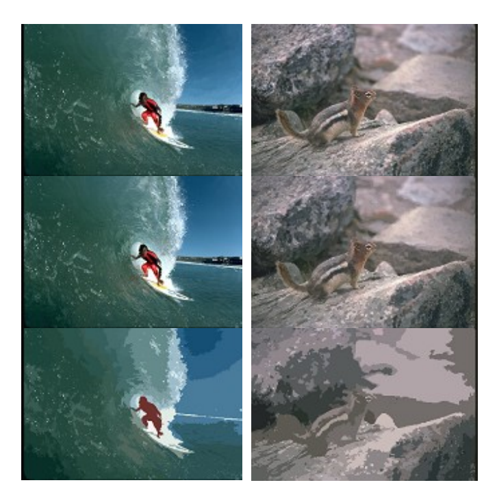
Figure 3: Initial images (top) and their segmentations (colorized images) produced by the nested homogeneous connections algorithm at level 1 (middle) and level 20 (bottom).

To conclude, the proposed method offers better results than the two other methods with regard to the quality of the segmentation obtained. The algorithm can be used to segment the image at high levels to extract the important visual components and to simplify it at low levels i.e. to be used as markers for connective filters such as levellings. Figure 3 illustrates two initial images and their segmentations produced by the nested homogeneous connections algorithm at low levels (i.e. level 1) and high levels (i.e. level 20). At the level 1, we show that the quality of the two images is very good. The produced images can be used as simplified images for other treatments. At the level 20, the quality of the two images obtained is less satisfactory but the produced images can be used to extract the important visual components.