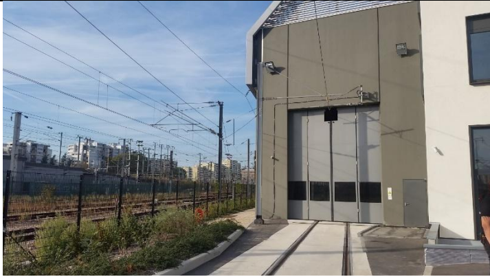
Figure 5 - Chapelle International (Paris 18 th arrondissement) a) Entrance to the railway hall, b) Entrance to the "Metro" warehouse