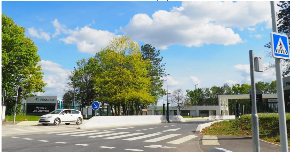
Figure 3 - Entrance to the Prologis "Moissy 2 Les Chevrons" logistics park in Moissy Cramayel (77)

operations, from the modification of planning documents to the marketing of buildings and the long-term maintenance of the parks (Raimbault 2022). The principle of these logistics parks thus leads to the privatization of part of the local development policies: the design, maintenance and even access to the logistics zone are the exclusive responsibility of the manager. It also privatizes economic development policies - the choice of companies renting in the park depending solely on its manager (Raimbault 2017).