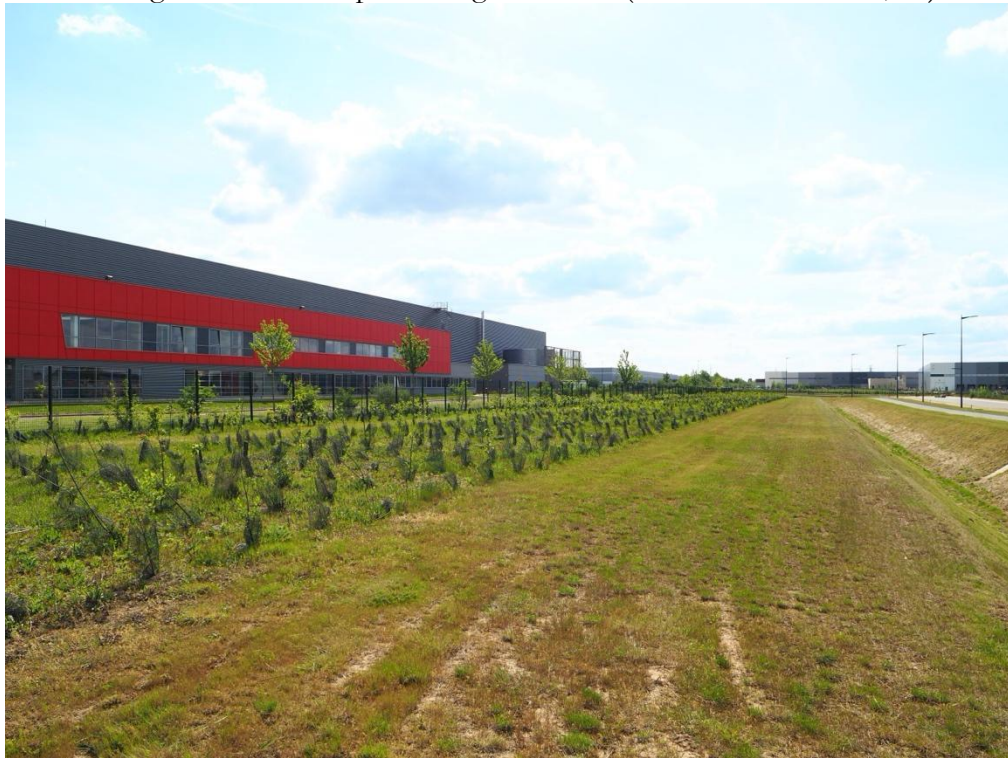
Figure 1 - Landscape of a logistics zone (Parc de l'A5 in Réau, 77)

2019) or Delhi (Gupta 2017). Indeed, the growing demand for logistics space is driving the dynamics of logistics location further and further out to the periphery. New warehouses are being set up in business parks (fig. 1), developed in the outer-suburbia, at the urbanization front, or even in the exurban fringes, where larger plots of land are available and cheap, and close to highway infrastructures, which makes it possible to compensate for the distance from the deliveries center by excellent road accessibility. In this sense, this logistics urbanization contributes directly to urban sprawl. The transformation of former agricultural land into logistics zones within the peri-urban ring road clearly contributes to land artificialization. The term "logistics sprawl" also emphasizes the similarities in these areas between the logics of residential and logistics outer-suburban development, combining the search for cheap land and road accessibility. In the case of the Paris region, outer-suburban warehouses represent more than 75% of the surface area of logistics real estate (Heitz 2017). The price of land for logistics activities is approximately €8,000/m 2 in the city of Paris, €5,500/m 2 in the inner suburbs and €1,350/m 2 in the outer suburbs 8 .