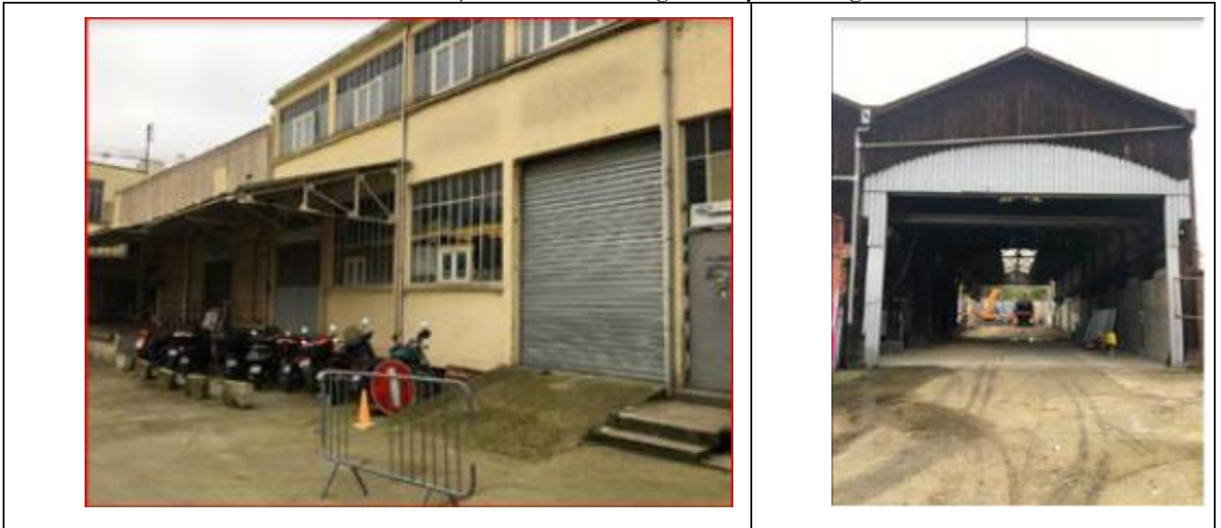
Figure 6 - Intermediate warehouses in the Paris inner suburbs, a) Saint Germain warehouse in Romainville, b) Warehouse being destroyed in Bagnolet