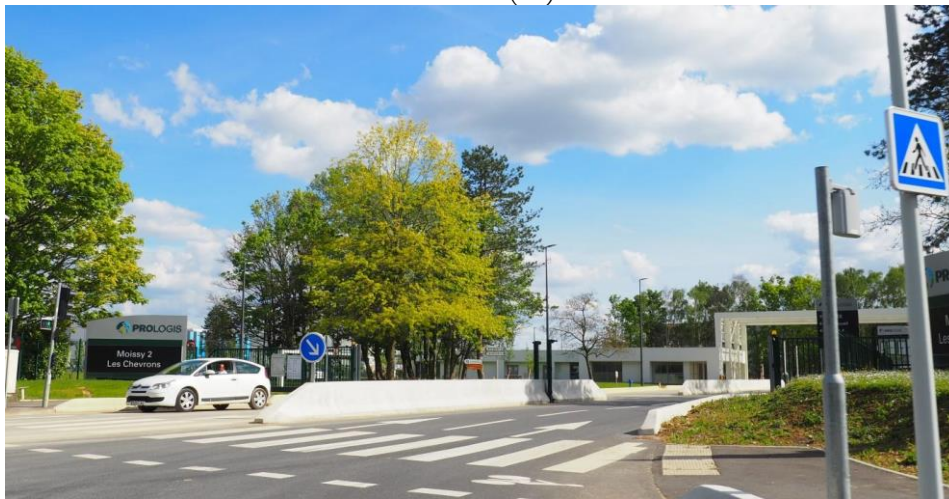
Figure 3 - Entrance to the Prologis "Moissy 2 Les Chevrons" logistics park in Moissy Cramayel (77)

operations, from the modification of planning documents to the marketing of buildings and the long-term maintenance of the parks (Raimbault 2022). The principle of these logistics parks thus leads to the privatization of part of the local development policies: the design, maintenance and even access to the logistics zone are the exclusive responsibility of the manager. It also privatizes economic development policies - the choice of companies renting in the park depending solely on its manager (Raimbault 2017).