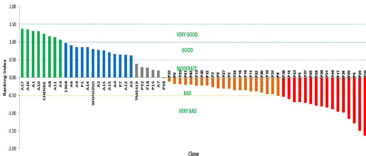
Figure 2. Variation of retting index among the 64 genotypes evaluated.