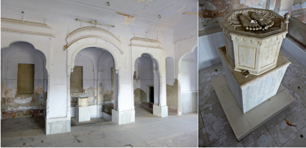
Figure 8. Pādukā of Paṇḍita Kesarisīṅha (VS 1880) waist-high on a pedestal sunk into the ground (R) in the back section of the shrine room separated off with arches (L) Pārśvanātha Digambara Jaina Mandira Nasiyām Śyōjī Godhā, Jaipur, December 2014.

them. It is remarkable that Paṇḍita Lālacandra himself consecrated the memorial stone, rather than calling upon the bhaṭṭāraka who was present nearby and is deferred to in the memorial's inscription. Apparently Paṇḍita Lālacandra had sufficient autonomy to undertake such a project and the ritual authority to consecrate the pādukā .