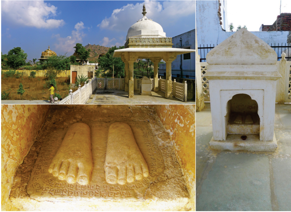
Figure 2. Carāṇa-chatrī of Bhaṭṭāraka Devendrakīrti (TL, Hindu chatrī in the background) with pādukā (BL) installed in small shrine (R), no legible date, mid-17th century. Kīrtistambha Nasiyān, Amer, February 2013.

At the Nasiyā in Sāṅgānera, a town south of Amer and Jaipur, a second memorial stone of Devendrakīrti was found. The pādukā was stored in a small, modern-day shrine, but its inscription refers to Narendrakīrti building a chatrī in VS 1696. This original chatrī may have become ruined, or removed to make space for a big temple building project underway at the site at the time of my visit (February 2013). The Sāṅgānera pādukā's inscription does not feature a reference to the Kachavāhā ruler, but includes other information rarely found on early modern Digambara memorial stones, concerning Devendrakīrti's death and succession and the consecration of his memorial. Devendrakīrti accordingly passed on the bhaṭṭāraka seat (paṭṭa dīyā) to Narendrakīrti on the 15th day of the dark half of the month of Kārttika in VS 1691 (22nd October 1634). 12 Devendra-