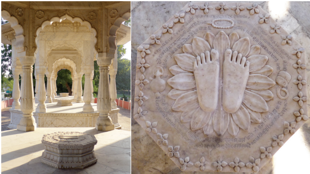
Figure 6. Bhaṭṭāraka caraṇa-chatrī (L) and pādukā of Bhaṭṭāraka Mahendrakīrti (VS 1853, R). Bhaṭṭārakiya Nasiyām, Jaipur, February 2013.

also differs in phrasing and orthography. The idea comes to mind that the pādukā may have been a prototype that was disapproved but later nonetheless installed on a simple pedestal. Perhaps it was used as a generic memorial for all earlier Ḍhūṇḍhāḍaśākhā incumbents like the kīrtistambha in Amer. The inscriptions of these three VS 1853 memorial stones record the continued rule of Mahārāja Savāi Pratāpa Siṅha (r. 1778–1803), 19 who was already on the throne at the time of the erection of the Amer kīrtistambha .