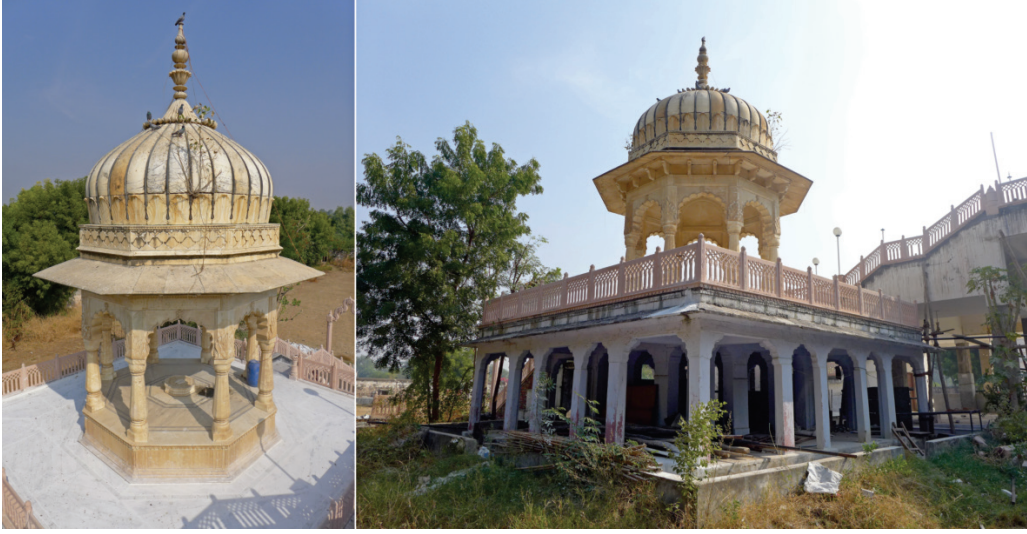
Figure 7. Carana-chatrī of Bhaṭṭāraka Sukhendrakīrti (VS 1886) raised on pillared platform with recently renewed balustrade, next to recent constructions (right on R). Bhaṭṭārakiya Nasiyān, Cākasū, December 2014.