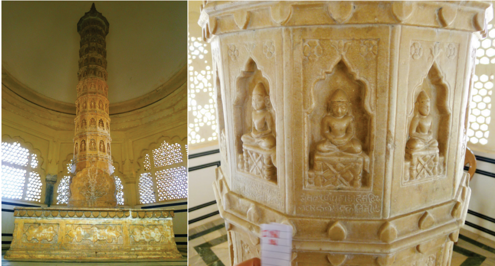
Figure 4. Ḍhūṇḍhāḍāsākhā kīrtistambha installed in a chatrī (L., VS 1845) with depictions of bhṭṭārakas (R., left Surendrakīrti , paṭṭa VS 1822; middle Kṣemendrakīrti , paṭṭa VS 1815; right undedicated). Kīrtistambha Nasiyām , Amer, February 2013.

captions giving their names and often dates of consecration. 13 At approximately four metres, the Amer pillar is taller than other discovered kīrtistambhas . It was erected in a dedicated chatrī , which is provided with stone lattices ( jālī ) between the pillars and as such appears a rather enclosed structure. A longer inscription near the base of the pillar chronicles its consecration but remained unfinished. Space was left blank for the day of the fortnight and the name of the reigning Kachavāhā monarch. Perhaps the missing data were meant to be inscribed as part of the consecration rituals of the kīrtistambha . Or, more pragmatically and maybe more likely, they were perhaps originally left open in consideration that the date of consecration might change and the ruler might pass before that time – and ultimately never got added. Yet Mahārāja Savāi Pratāpa Siṅha (r. 1778–1803), who had been on the throne in Jaipur for ten years at the time of the memorial’s consecration, flourished and reigned for another decade and a half.