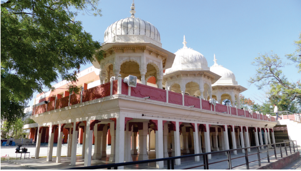
Figure 5. Platform with three bhaṭṭāraka caraṇa-chatrīs, VS 1853 (right and middle) and VS 1881 (left), Bhaṭṭārakīya Nasiyām, Jaipur, February 2013.