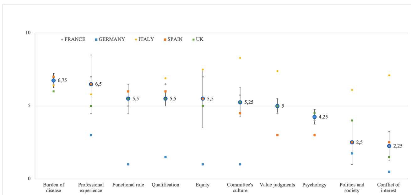
Fig. 1. Scores (median and IQR) given by experts to the degree of influence of implicit factors in the HTA deliberative process.

Regarding the category of inclusiveness, most of the experts (17/20)