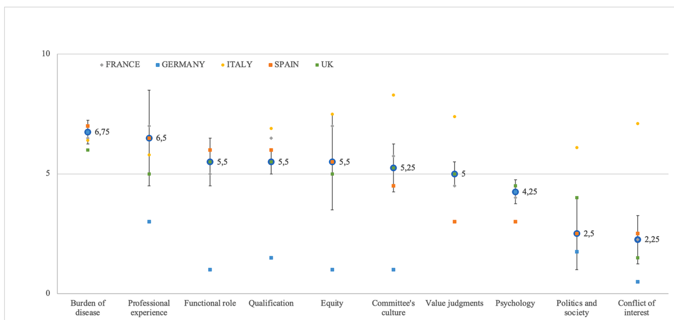
Fig. 1. Scores (median and IQR) given by experts to the degree of influence of implicit factors in the HTA deliberative process.

Regarding the category of inclusiveness, most of the experts (17/20)