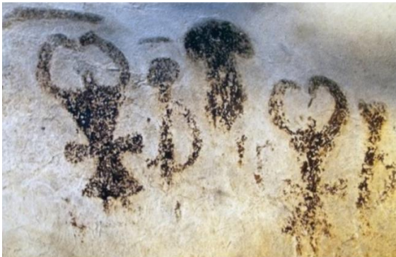
Ithyphallic scenes and fungus from cave Magurata, guano paintings