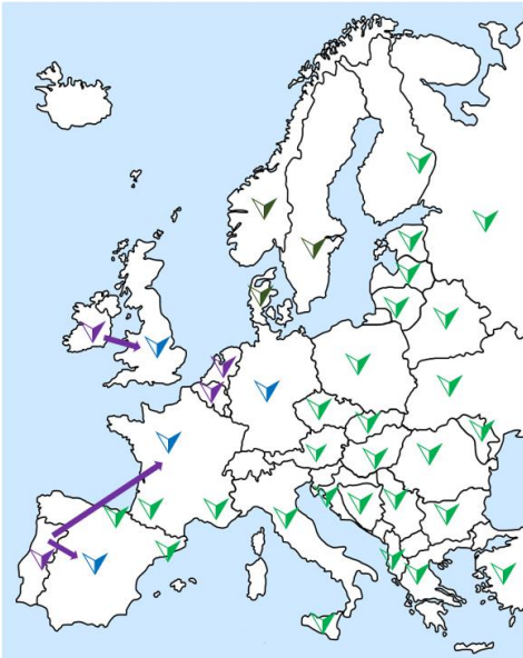
Map modified from Pixabay License-Europe carte la géographie https://pixabay.com/fr/illustrations/europe-carte-la-géographie-587511/