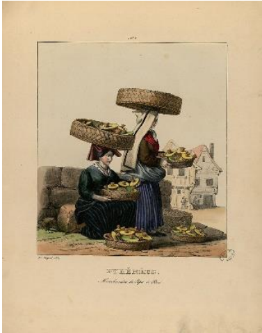
© Edouard Pingret 1834 Wikimedia- https://fr.wikipedia.org/wiki/Cèpe#/media/Fichier:Pyrénées