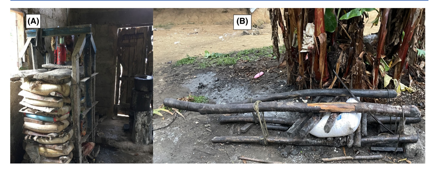
Figure 2. Grated pulp dewatering methods adopted in Nigeria (A) and Cameroon (B).

as color, and textural properties like smoothness, mouldability, and stretchability.<sup>21</sup> The quality attributes of the roots that were examined correspond to the properties identified by processors that contribute to excellent food products.<sup>41</sup> These properties include physiological characteristics of the raw roots, processing attributes such as ease of peeling, and physiochemical traits like dry matter or starch content.