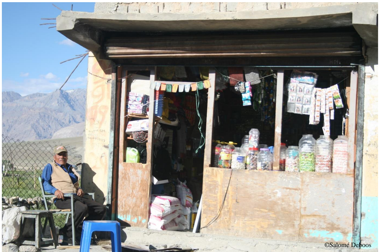
PICTURE 17: ZANSKARPA IN FRONT OF HIS SHOP IN THE OLD PADUM AREA, 2017

As a result, Zanskar has seen a flourishing of commerce in virtually all sectors. Padum alone boasts around thirty restaurants and dabas , all of which are closed from the end of September to the beginning of June. They are run by migrant workers from Nepal or from the Tibetan refugee colonies in Leh or Dharamsala.