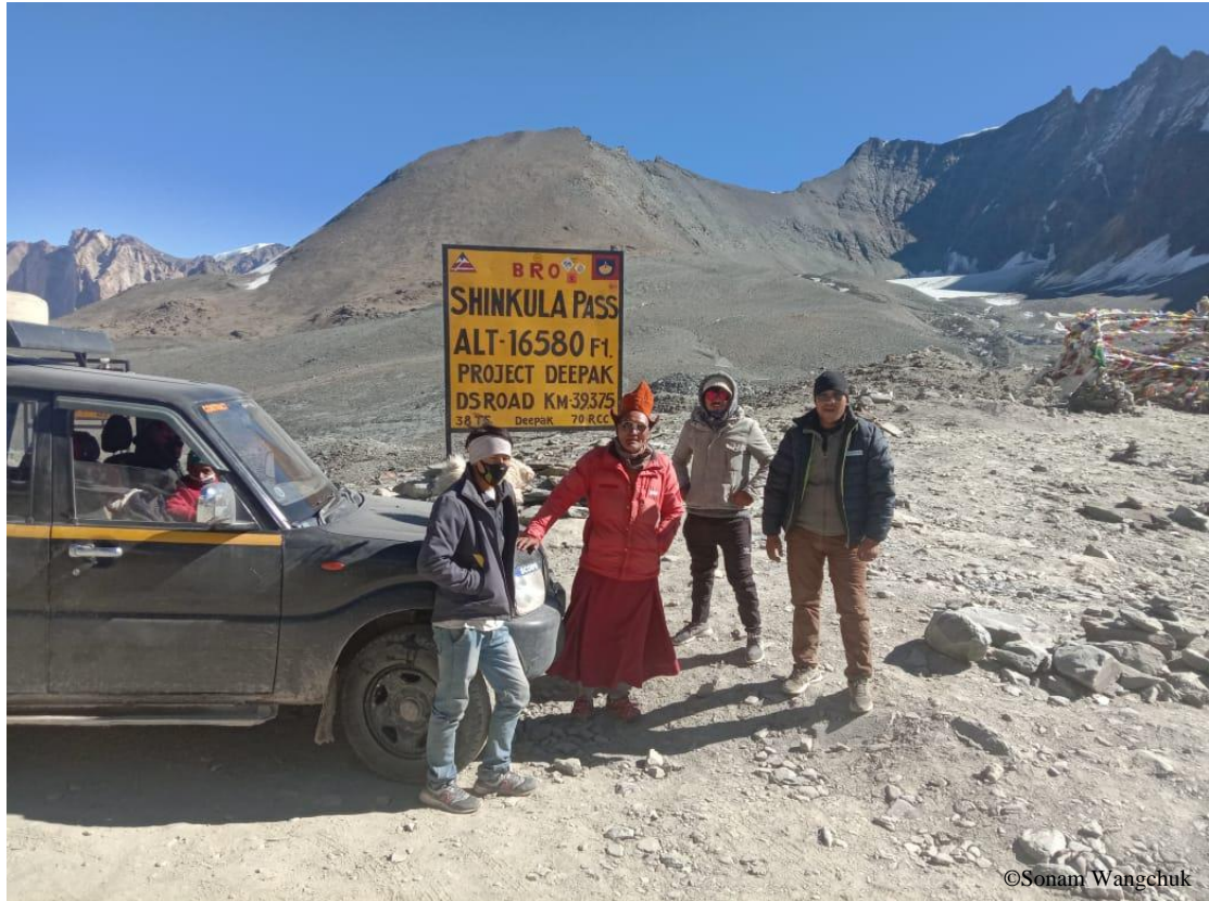
PICTURE 13 : ON THE PASS ON THE NEW ROAD FROM PADUM (ZANSKAR) TO MANALI (HIMACHAL PRADASH). 2020.

This broader cuisine requires that a variety of vegetables, cattle, and poultry be imported in sufficient quantities to feed the whole population during the summer. Poultry came mainly from Kashmir until summer 2019, but this summer 2020, they were carrying from Himachal Pradesh thanks to the new high road.