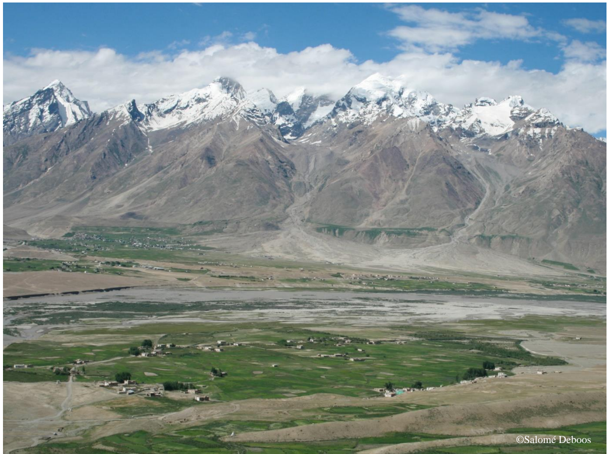
PICTURE 1: OVERVIEW OF ZANSKAR VALLEY TAKEN FROM KARSHA MONASTERY OPPOSITE PADUM VILLAGE, 2017

Zaskar sits between the Himalayan chain and the Indus valley, situated between the borders of China, Afghanistan, and Pakistan. Geographically, it constitutes one of the five regions in Ladakh. Administratively, it is a tehsil of the district of Kargil, which itself is part of the LAHDC (Ladakh Autonomous Hill Development Council) whose second constituent is the district of Leh.