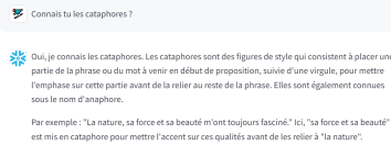
(a) Arctic LLM giving the wrong definition of a cataphora in French

Addressing this challenge necessitates the utilization of comprehensive linguistic datasets that encapsulate the syntactic and semantic diversity across languages. These datasets should facilitate a deep understanding of pronoun placement, referent relationships, and how syntactic structures influence interpretation. Additionally, the semantic properties of pronouns and referring expressions across different languages must be meticulously accounted for. This entails interpreting not only the syntax but also the semantic cues that are pivotal for the effective resolution of cataphoric references [1, 39, 41, 8, 19, 11, 4].