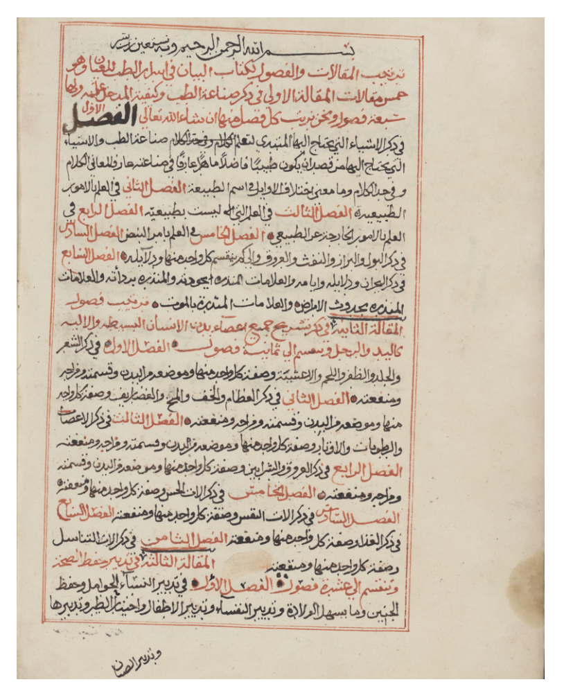
Figure 2. National University Library of Strasbourg, MS 4187, fol. 10 - Strasbourg, France

Firstly, Grover et al. [8] developed a prototype system focusing on the recognition of person and place names in the digitised records of British parliamentary proceedings from the late 17th and early 19th centuries. The system accepts OCR engine output as input and employs a rule-based NER system implemented using LT-XML2 and LT-TTT2 text processing tools, addressing particular challenges and errors associated with OCR data.