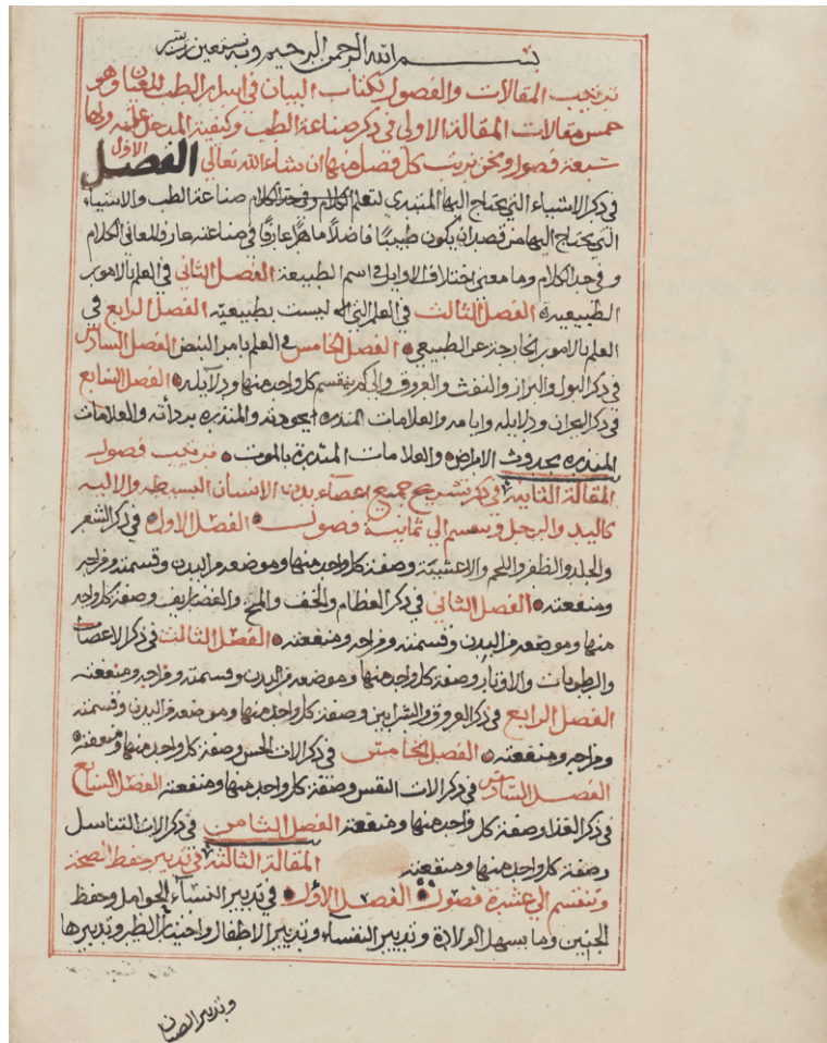
Figure 2. National University Library of Strasbourg, MS 4187, fol. 10 - Strasbourg, France

Firstly, Grover et al. [8] developed a prototype system focusing on the recognition of person and place names in the digitised records of British parliamentary proceedings from the late 17th and early 19th centuries. The system accepts OCR engine output as input and employs a rule-based NER system implemented using LT-XML2 and LT-TT2 text processing tools, addressing particular challenges and errors associated with OCR data.