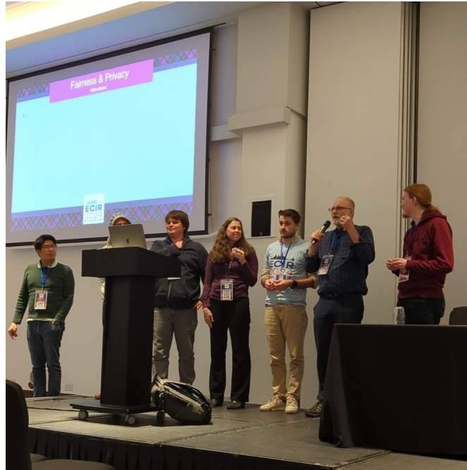
Figure 1. Solving fairness in IR, one sentence at a time.

potential collaborations. By providing some structure around these activities, we aimed to engage with more of the community and help form connections that may have otherwise been missed.