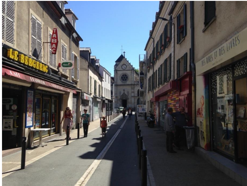
Figure 3. Rue de l'Église (2017)

The survey was conducted in 2017 3 and covered the entire downtown area of Montreuil (see Rollinde, 2017). After an exhaustive inventory of businesses, all 611 retailers within the perimeter were asked to answer a questionnaire. The survey focused on their opinion about the neighborhood and, more broadly, about Montreuil and their clientele, but also on the changes over time. We also asked them about changes they made to their activity. 66 shopkeepers agreed to answer the questionnaire (including 6 in the Rue de l'Église) and we conducted in-depth interviews with eight of them (including 2 in the Rue de l'Église), in order to understand their personal and professional background and its articulation with their commercial strategies.