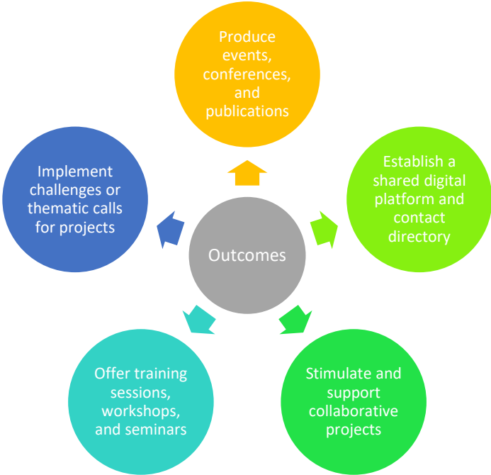
Figure 3 : Summary of outcomes of the Living Lab Mix

As a whole, these various deliverables, whether they are event-based, collaborative, educational, or incentivizing, aim to measure the effectiveness of the Mix Living Lab in meeting the expectations expressed by stakeholders. They will also serve as key indicators to track the impact of these initiatives on the development of an open and inclusive innovation ecosystem within the Rouen metropolitan area.