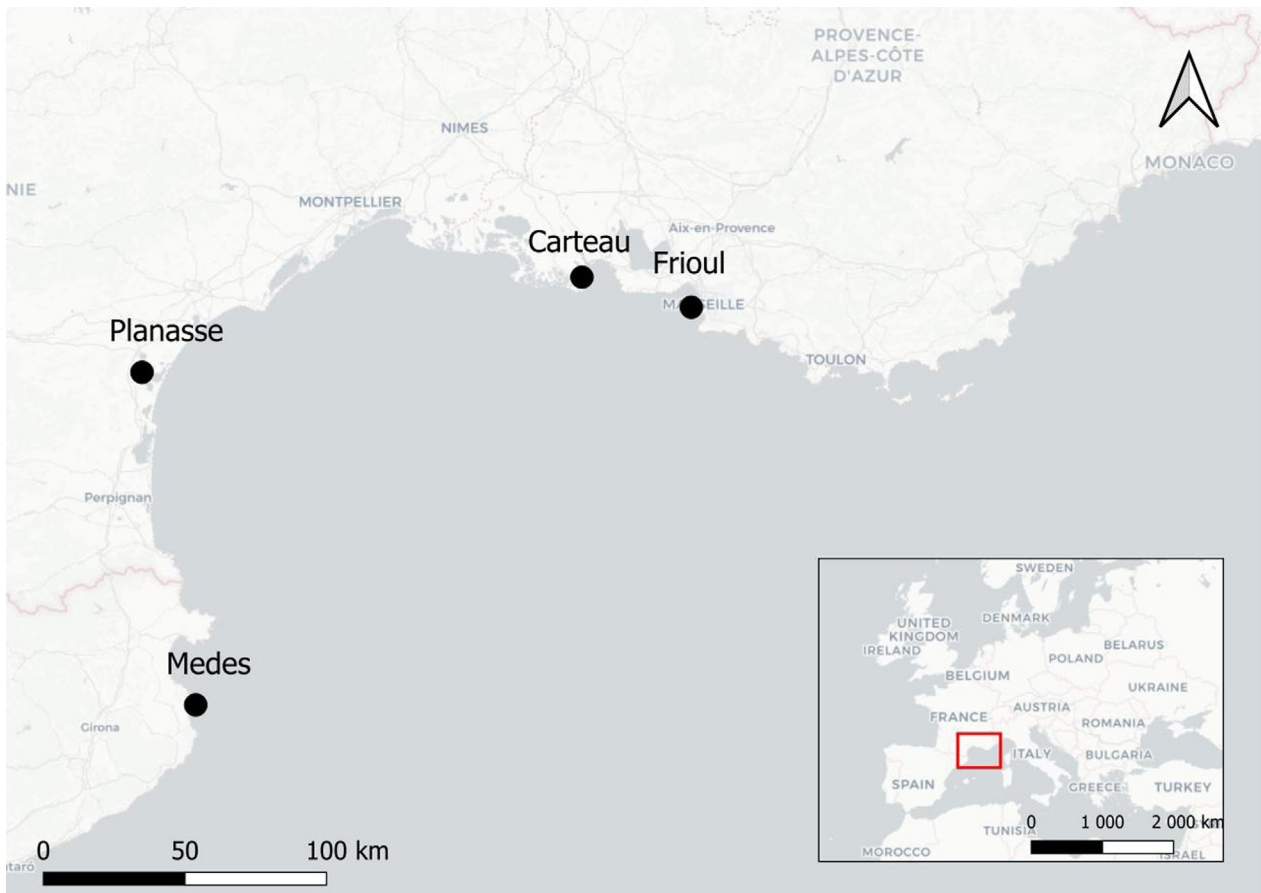
Figure 1. Location of the four monitored Yellow-legged Gull colonies along the northwestern coast of the Mediterranean Sea.

temporary, coloured rings. Once they reached a suitable size, these rings were replaced with metal and PVC rings engraved with unique alphanumeric codes. As per Langlois et al. (2023), we considered four breeding parameters: (1) hatching success (binary, whether at least one egg hatched or not), (2) number of hatched eggs per nest, (3) fledging success (binary, whether at least one chick per hatched nest fledged or not), and (4) number of chicks that fledged per nest. To enable a direct comparison with the results of Langlois et al. (2023), we did not take into account clutch size in these estimates.