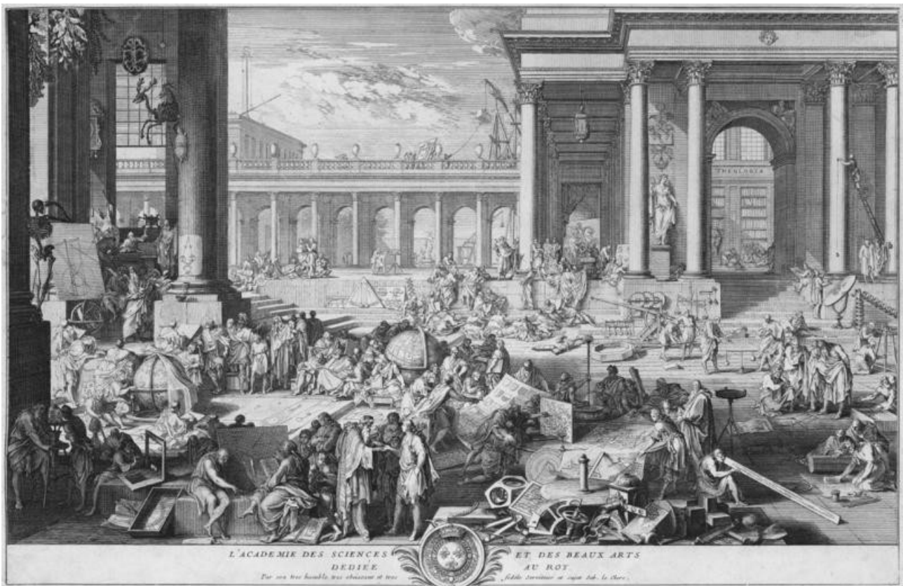
Academie des sciences

The fundamental intuition of NOTCOM is that this is a mistake because consensus formation is by nature historically structured. It represents those shared assumptions that in any given scientific debate are regarded as non-controversial. Such consensus comes about through complex temporal and historical patterns. It evolves differently from one discipline to the other. It develops and changes, sometimes quite radically. But it is not only the object of scientific consensus—i.e. what scientists agree upon—that evolves. Scientific consensus itself — what such agreement amounts to, how it is grounded, who is eligible to take part in its formulation, and what value it has — has a complex history. Understanding scientific consensus, therefore, requires historical study. Based on this intuition, NOTCOM undertakes to write a part of that history and explore its contemporary potential, namely the history of scientific consensus in the seventeenth century.