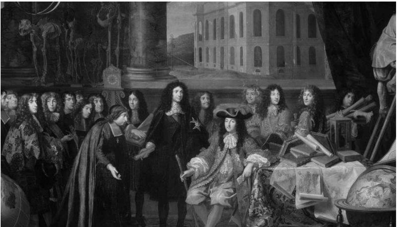
Naissance de l'académie 1666

As of January 2023, the Maison Française d'Oxford (MFO) co-hosts a five-year project on seventeenth-century natural philosophy entitled The Common Notion: Science and Consensus in the Seventeenth Century (NOTCOM), funded by an ERC Advanced Grant. Before assuming my role as the Principal Investigator of ERC project, I worked as a senior researcher at the MFO (2019-2022) with colleagues in Oxford and France on the framework for this project, which includes collaboration with the Oxford Centre for Intellectual History , the Oxford Centre for the History of Science, Medicine, and Technology , and other Oxford-based research centres. I hope this project will help to create and consolidate strong bilateral relations between British and French intellectual historians and historians of science, and in particular expand the already strong institutional relations between the CNRS and Oxford. The project will include a team of postgraduate and postdoctoral researchers, recruited in France or in the UK, and co-ordinate lectures, workshops, and conferences in Oxford, Lyon, and elsewhere, in collaboration with colleagues on both sides of the English Channel.