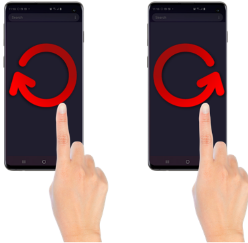
Fig. 1. Eyes-free circular gestures

LAURENT GRISONI, Université de Lille, France