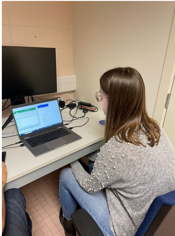
Fig. 2. The setup we used for circular eyes-free gesture evaluation. The user was sitting in front of the computer that was showing instruction. The user was drawing gesture to smartphone which was held under the table to avoid visual cues.

The experiment was conducted in a silent room where participants sat comfortably on a chair in front of a desk. They held the smartphone in their right hand and placed it under the table to restrict the view. The participants looked at the monitor screen placed on the desk that displayed the instructions for the task. Participants were provided with a brief training session to familiarize them with the eyes-free drawing setup. Subsequently, they were guided through a series of trials where they drew arcs of different degrees in both clockwise and counterclockwise directions. Each degree of the arc was repeated four times to account for variability.