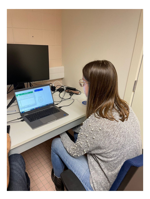
Fig. 2. The setup we used for circular eyes-free gesture evaluation. The user was sitting in front of the computer that was showing instruction. The user was drawing gesture to smartphone which was held under the table to avoid visual cues.

The experiment was conducted in a silent room where participants sat comfortably on a chair in front of a desk. They held the smartphone in their right hand and placed it under the table to restrict the view. The participants looked at the monitor screen placed on the desk that displayed the instructions for the task. Participants were provided with a brief training session to familiarize them with the eyes-free drawing setup. Subsequently, they were guided through a series of trials where they drew arcs of different degrees in both clockwise and counterclockwise directions. Each degree of the arc was repeated four times to account for variability.