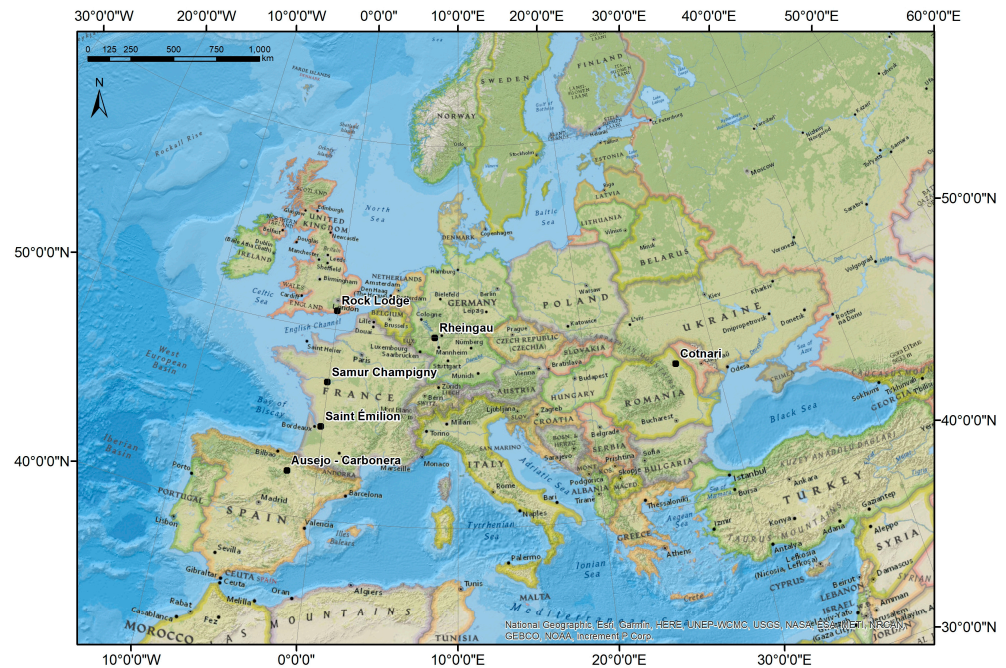
Figure 1. Location of studied European wine regions.