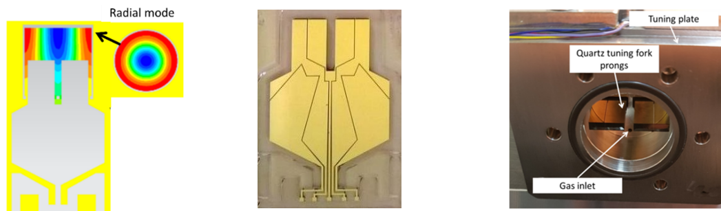
Fig. 1. Finite element simulation of our optimized tuning fork (left), and realization (middle). Coupling of the QTF with a cylindrical acoustic resonator (right).

Work began by establishing the analytical and finite element models (see Figure 1) used to describe the physical phenomena involved [2]. These unique models enabled to optimize and patent quartz resonators-based detectors for photoacoustic spectroscopy, while considering future industrial constraints, such as optical alignment. First prototypes were fabricated and tested on different gases: C_2H_2 , CO_2 , H_2O , NH_3 to confirm the detector versatility. We demonstrated state-of-the-art performances: we obtained the best quality factors at atmospheric pressure [3] as well as an optical alignment greatly facilitated while keeping state-of-the-art sensitivity [4].