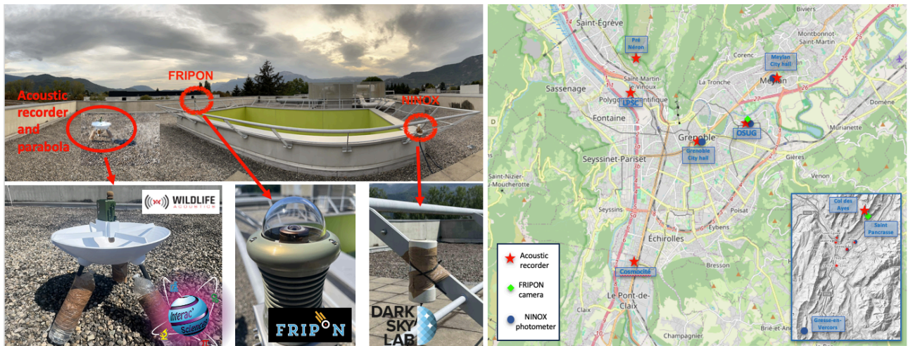
Fig. 1. Left: The roof of OSUG equipped with the NINOX photometer, the FRIPON all-sky camera and two acoustic recorders, one being at the focus of a 40cm 3D-printed parabola Right: Map of the Grenoble metropolitan area