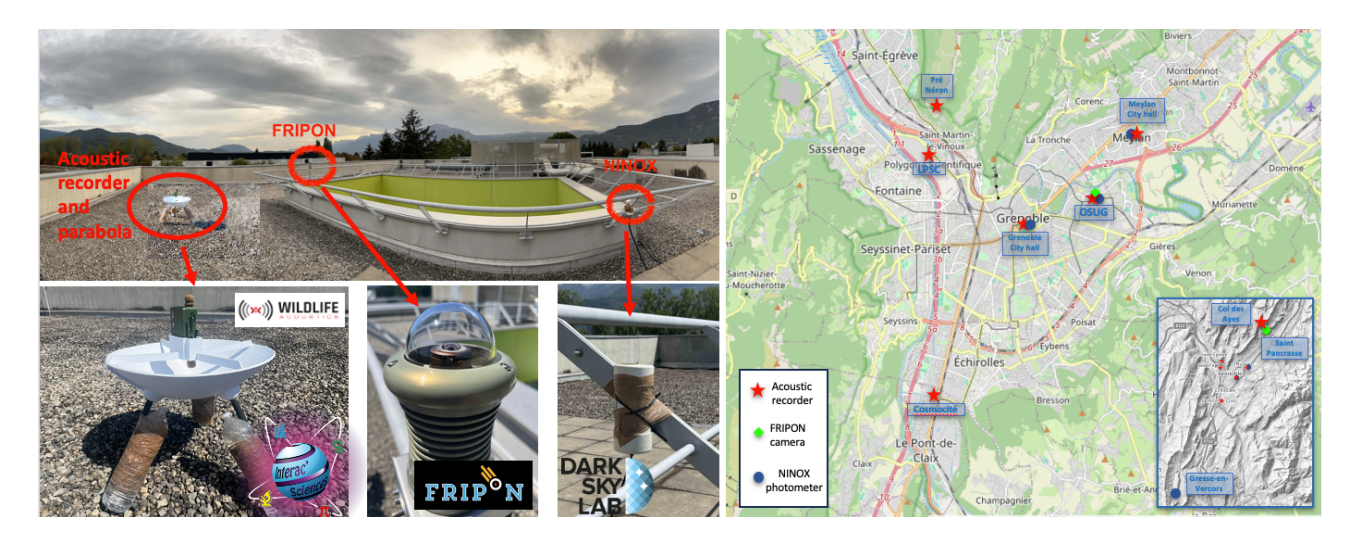
Fig. 1. Left: The roof of OSUG equipped with the NINOX photometer, the FRIPON all-sky camera and two acoustic recorders, one being at the focus of a 40cm 3D-printed parabola Right : Map of the Grenoble metropolitan area