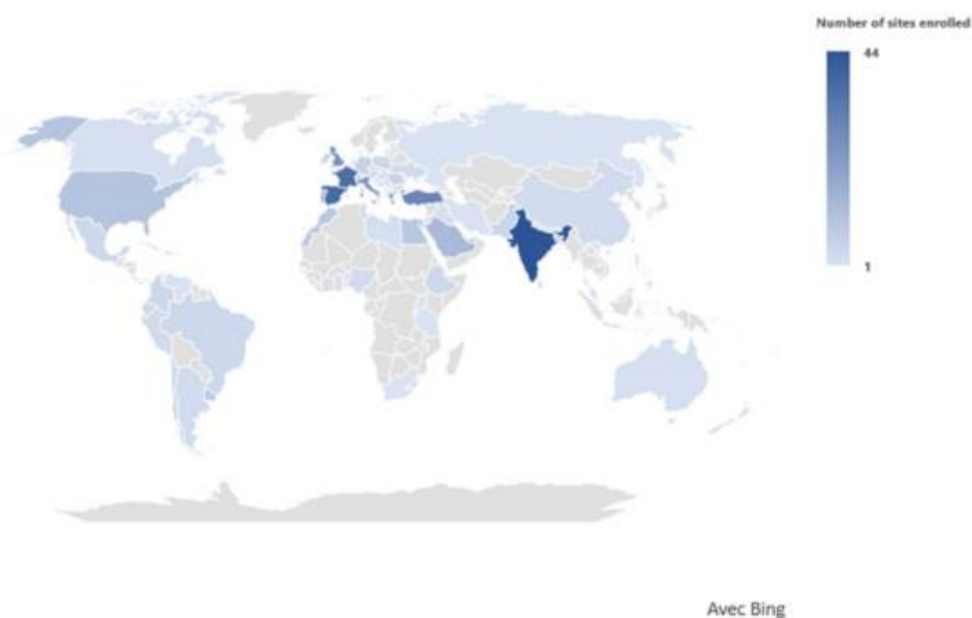
Fig. 1 Map chart showing participating countries across geographical regions

In the ICUs from the intervention cluster, ESICM officers will make contact once a week to assess a rough estimate of the intervention's dosage. Each of the six components will be scored from 0 to 4, as illustrated in Table 3.