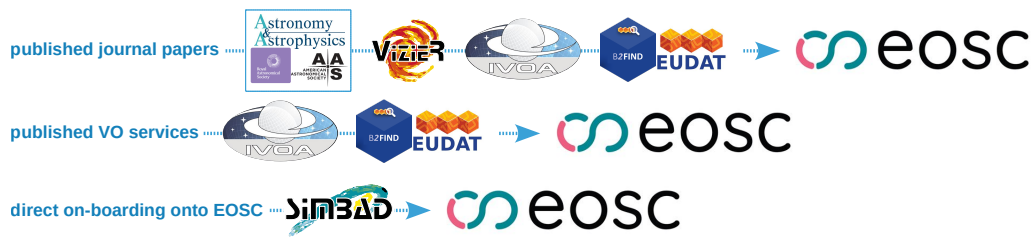
Fig. 2. Paths for astronomy resources to become visible in the EOSC Marketplace/Portal. i) Published papers with associated data in the CDS VizieR service become visible in EOSC via the successive harvesting of the metadata by the Virtual Observatory registry, the EUDAT B2FIND service, and the integration of B2FIND in EOSC. ii) Similarly Virtual Observatory services in general are harvested by EUDAT B2FIND and hence become visible in EOSC. iii) There is also the possibility of directly on-boarding services, such as has been done for the CDS SIMBAD, with the CDS as the EOSC 'service provider'.

Several use cases have been explored by teams at the Observatoire de Paris, through various projects, namely, ESCAPE, Europlanet, FAIR-IMPACT, NenuFAR and VAMDC: