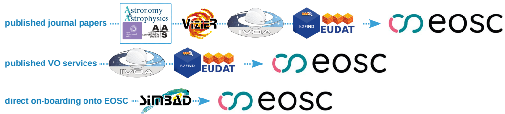
Fig. 2. Paths for astronomy resources to become visible in the EOSC Marketplace/Portal. i) Published papers with associated data in the CDS VizieR service become visible in EOSC via the successive harvesting of the metadata by the Virtual Observatory registry, the EUDAT B2FIND service, and the integration of B2FIND in EOSC. ii) Similarly Virtual Observatory services in general are harvested by EUDAT B2FIND and hence become visible in EOSC. iii) There is also the possibility of directly on-boarding services, such as has been done for the CDS SIMBAD, with the CDS as the EOSC 'service provider'.

Several use cases have been explored by teams at the Observatoire de Paris, through various projects, namely, ESCAPE, Europlanet, FAIR-IMPACT, NenuFAR and VAMDC: