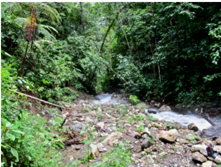
Illustration de la couverture :