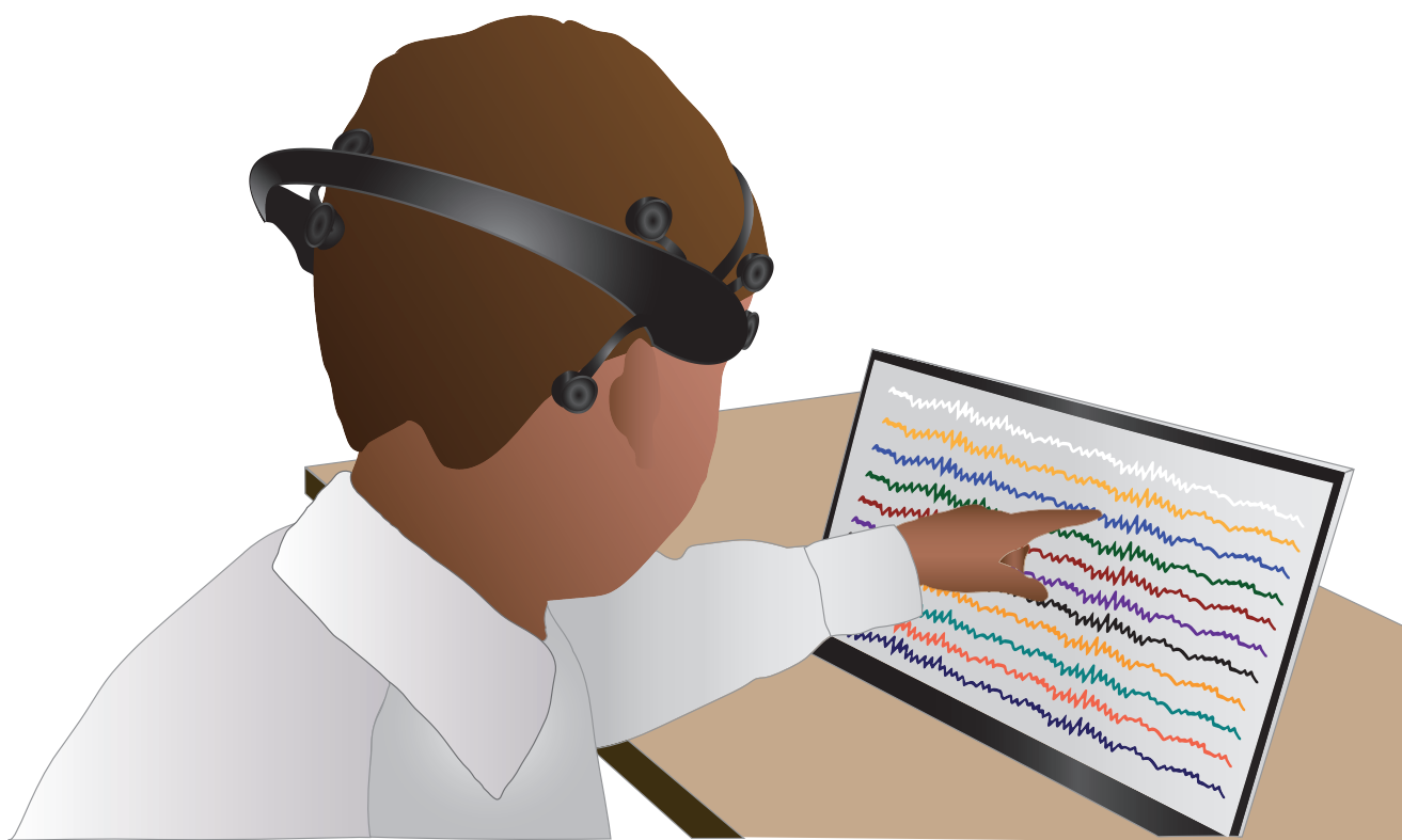
Figure 1: An EEG recording in 2024.

Reflecting on its history, our survey respondents reported that clinical diagnosis is where EEG has had its most significant impact. Today, EEG is supported by well-established scientific and professional societies that foster its use across the globe 4 . Indeed, it is often the only neuroimaging modality available in resource-limited clinical settings and remains the only imaging modality shown to be successful for mass screening of brain dysfunction 5 .