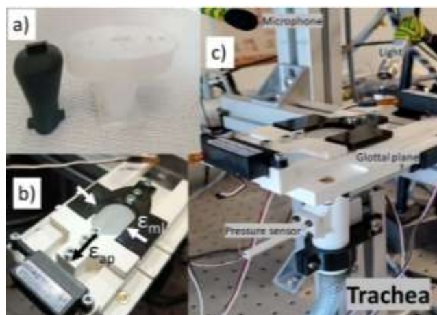
Figure 1: (a) Vocal folds and the 3D-printed inner mold, (b) Applied pre-strains, (c) General view of the testbed

Vocal fold replica. An existing articulated larynx testbed with folds actuation in longitudinal stretching was used as a starting block (5). Improvements were made on the artificial larynx and its actuation in lateral compression. Laryngeal envelope and vocal folds were molded into a single block of homogeneous silicone rubber of shore hardness 00-30. The folds' length at rest was 12mm and their thickness was 1.5mm. Their geometry was inspired from M5 models (8), corresponding to a simplified two-circle version of Microvoice model (5).