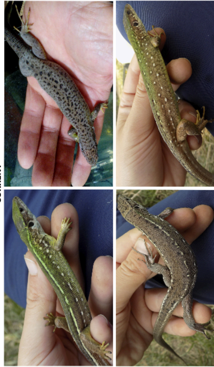
Figure 2. «Mediterranean morphotypes» and «leopard morphotype» of L. viridis from southern and central Ukraine respectively.

By studying the morphology of both museum specimens from the 1960s (n = 50) and comparing with modern populations (2012-2017, n=97), we noticed an increase in number of anomalies of head foldiosis in the most recent specimens (21.1%). Recent field censuses and observations in our field sites throughout Ukraine also revealed an increase in the occurrence of rare or so-called abnormal morphs - melanized forms, "mediterranean morphotype" (Odesa and Mykolaiv regions) and "leopard morphotype" (Cherkasy region), with visible signs of viral (Reoviridae) papillomas in the populations of southern Ukraine.