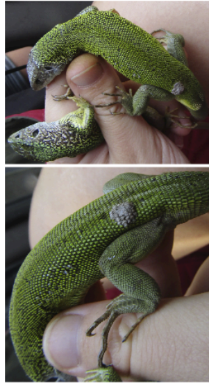
Figure 3. Viral papillomas (Reoviridae) from L. viridis of southern populations in Ukraine. In a population of Sukhyi Lyman, Odesa, up to 15% of the detected lizards are have visual evidence of these viral papillomas.

By studying the morphology of both museum specimens from the 1960s (n = 50) and comparing with modern populations (2012-2017, n=97), we noticed an increase in number of anomalies of head foldiosis in the most recent specimens (21.1%). Recent field censuses and observations in our field sites throughout Ukraine also revealed an increase in the occurrence of rare or so-called abnormal morphs - melanized forms, "mediterranean morphotype" (Odesa and Mykolaiv regions) and "leopard morphotype" (Cherkasy region), with visible signs of viral (Reoviridae) papillomas in the populations of southern Ukraine.