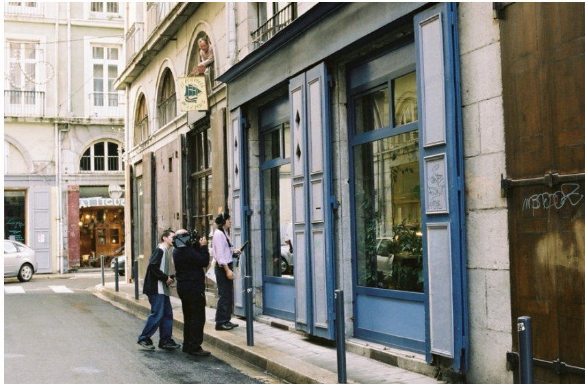
Figure 1. Jean-Pierre Beauviala with Raymond Depardon in front of an Aaton window display on rue de la Paix Grenoble, 27 March 2006, photo by Valentina Miraglia