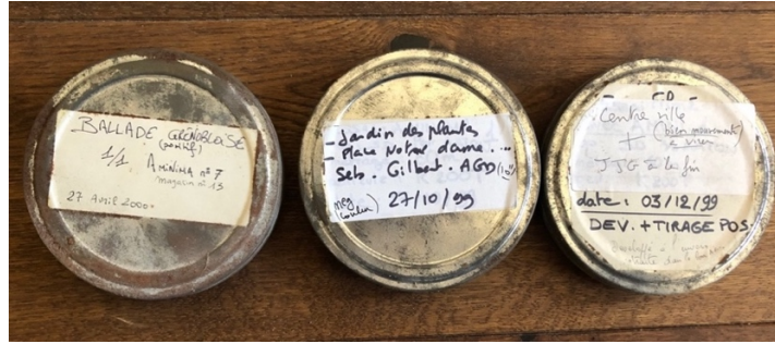
Figure 5. Test films

Furthermore, this “stepping out of the Aaton workshops” into the neighbourhood, as it was termed in 1978 by Les Cahiers du cinéma in reference to the Lumière Brothers’ first film, became a ritual for those who came from afar 10 to Grenoble to visit Aaton and meet Beauviala. Countless directors and technicians have made what we have come to call “the visit to Grenoble” (Sorrel, Tixier, 2022). The traces of these visits, which we have been able to observe in various forms (i.e., photos, films, and interviews), show how a media and technical and artistic scene arose in Grenoble because of Aaton’s ability to exist at the margins of a film industry that was otherwise located mainly in the Paris region.