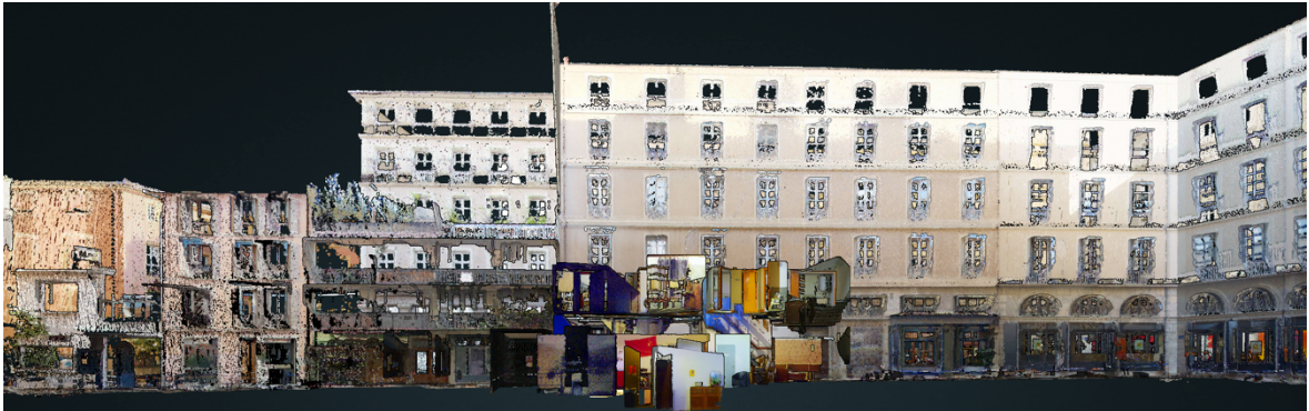
Figure 7. Tests for depicting Rue de la Paix and the Aaton premises – 3-D point cloud UPR MAP – created by Livio de Luca and Laurent Bergerot

ideas that could be discussed and especially tested. The goal was not a formal or structural mastery of the whole, rather to test systems and leave some parts open to their potential extension. These are the same principles as the ones adopted by Brazilian architect and artist Sérgio Ferro, who came to Grenoble in the early 1970s. Ferro advocated for endless remodelling and collective experimentation with the craftsmen, even if this meant tearing something completely apart and starting over from scratch. Far from “the hypostasis of the project for normal architects”, Ferro asserted “the priority of the work in progress in a world dominated by productive capital” (2024).