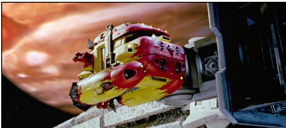
Figure 1. Transport of Goods and Materials in Space Fantasy Science Fiction Narratives: The Case of the Pachyderms in the Space Truckers film