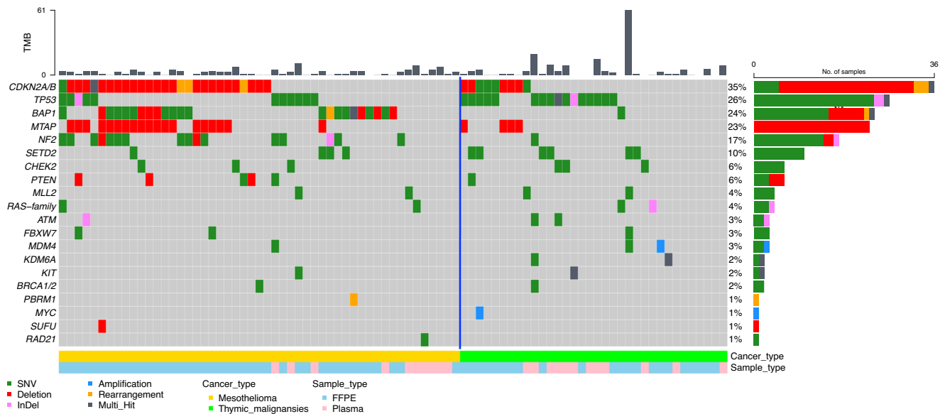
Fig. 2 Oncoplot of the 20 most common molecular alterations. Oncoplot summarizing the main molecular alterations in mesothelioma (yellow squares, left part of the plot) and thymic malignancies (green squares, right part of the plot). TMB is highlighted at the top of the figure. Molecular alterations: SNV in green, deletion in red, InDel in pink, amplification in blue, rearrangement in yellow and multi-hits in dark grey.

Comprehensive genomic profiling was performed with a targeted next generation sequencing (NGS) test (FoundationOne ® CDx) of >300 genes, including MSI and TMB, using DNA isolated from FFPE tumor tissue specimens. If tumor tissue was not available or inadequate, the analysis was performed by FoundationOne ® Liquid CDx on ctDNA isolated from plasma. FoundationOne ® CDx and FoundationOne ® Liquid CDx have high accuracy and analytical sensitivity, although there may be some differences between the two tests due to the nature of the sample they analyze. Results also depend on the specific genetic alterations being analyzed, tumor heterogeneity, and the quality of the sample. No TMB calculation was reported at the beginning of the project using FoundationOne ® Liquid CDx.