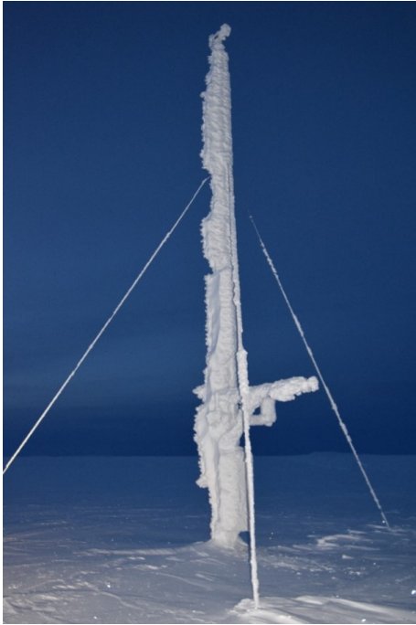
Figure 3. Meteorological station covered with rime before maintenance in Reinhauger, Varanger peninsula, Norway.

identities. “To some degree, we follow what is being hyped, you know, if something is being hyped in nature” [LSM]. Model developments were presented as being responsive and at the service of others: “There is no master plan. It’s opportunity driven, it depends on projects that come in, (...) on what some of the users want to do. It’s kind of nice” [SPM]. When questioned about what the priorities for snow model developments are, one SPM answered as follows: “It’s not just the snow modellers who can answer that. It is the people who want to use the snow models”. Arguably, performance-based research funding systems like the UK Research Excellence Framework have been in place long enough in some countries for researchers to have adapted to the constraints of the “publish or perish”, “be funded or fade out”, and “impact or pack in” culture.