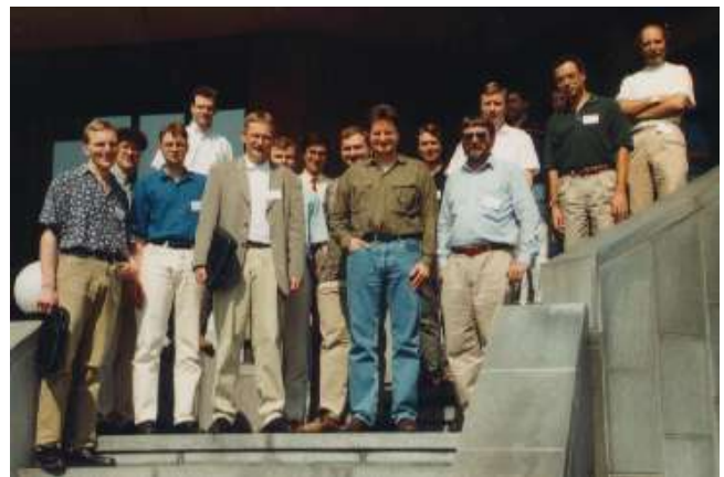
Figure 3: Participants of CADUI '96 [33], the second CADUI.

of Interactive Systems (DSV-IS). Over time, the event evolved to become a standalone international workshop, and run from 1994 [26] to 2008 [12]. DSV-IS placed a special emphasis on formal methods, providing a forum to investigate the design and specification of interactive systems, along with their properties at the interaction level that are suitable for formal verification.