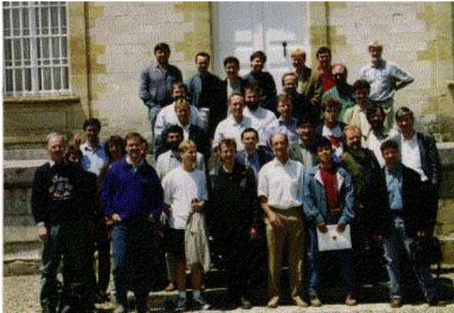
Figure 1: Participants of DSV-IS '94 [26], the first DSV-IS.

Even if established as an ACM conference in 2009, EICS stands out in the landscape of HCI conferences due to its long history rooted into the combination of several foundational conferences (DSV-IS, CCL, EHCI, CADUI, and TAMODIA), each with its peculiar legacy and contributions to the field. This resulted in a unique venue that encapsulates a broad spectrum of HCI research and practice. The conference had and still keeps the ability to adapt and incorporate emerging topics in the dynamic and evolving field of interactive systems.