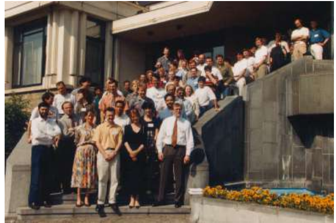
Figure 2: Participants of DSV-IS '96 [3], the third DSV-IS.

A second branch started 30 years ago with the first edition of the Eurographics workshop on Design, Specification, and Verification