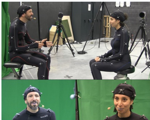
Figure 1: The Trueness forum theatre corpus

professional actors with expertise in this area. Each scene is represented by two separate videos depicting the perspectives of the individuals involved in the interaction. Figure 1 shows images taken during the recording of the dataset. It illustrates the recording methods and the positioning of the actors. The data extracted and processed from this dataset are called the ground truth data.