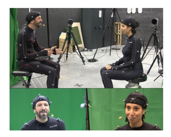
Figure 1: The Trueness forum theatre corpus

professional actors with expertise in this area. Each scene is represented by two separate videos depicting the perspectives of the individuals involved in the interaction. Figure 1 shows images taken during the recording of the dataset. It illustrates the recording methods and the positioning of the actors. The data extracted and processed from this dataset are called the ground truth data.