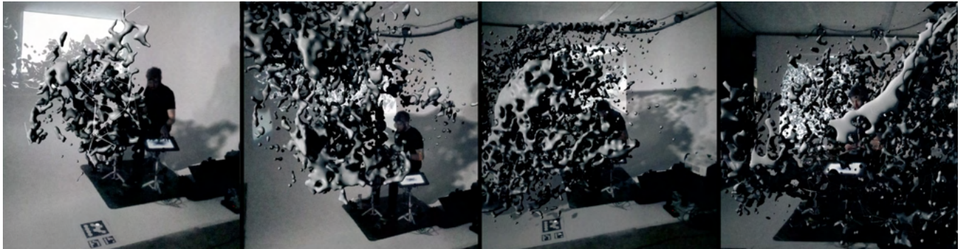
Figure 2: The image sequence shows the evolution of the visuals starting from left to right from different points of view.

the viewer from observing through the smartphone and enhancing the immersion of the experience in the moment, in a completely live way that must be experienced in person, in the moment, and retaining - even enhancing - the sociability and shared experience. These are important aspects to explore for the future of live entertainment, and this unique collaboration across industry, academia and creativity offers a unique opportunity to do so.