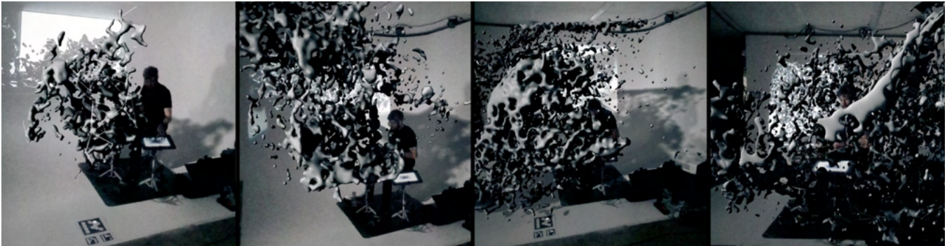
Figure 2: The image sequence shows the evolution of the visuals starting from left to right from different points of view.

the viewer from observing through the smartphone and enhancing the immersion of the experience in the moment, in a completely live way that must be experienced in person, in the moment, and retaining - even enhancing - the sociability and shared experience. These are important aspects to explore for the future of live entertainment, and this unique collaboration across industry, academia and creativity offers a unique opportunity to do so.