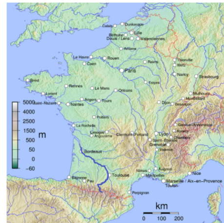
Figure 1: Garrone river area

In [4], Dr.Kaniav Kamary, Dr. Merlin Keller, et al, used mixtre model to predict water heigh at 2 position Marmande and Mas Agenais.The simulation also used Gaussian Process and runs independently of the two outputs.