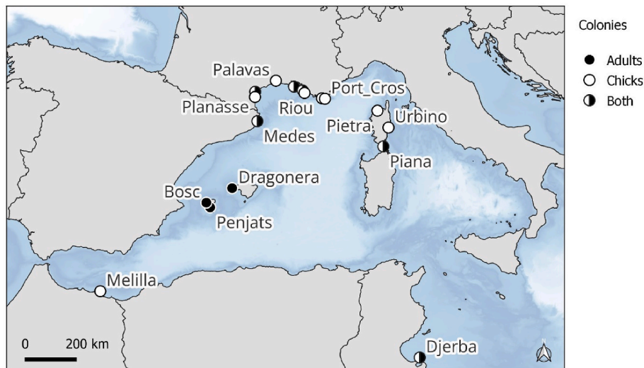
Fig. 1. Map of the different colonies studied, with samples collected on chicks and/or adults. Projection ESPG:3035. Coordinates of the colonies can be found in Table 1.

once a year in gulls during the post-breeding period (Olsen and Larsson, 2003; Sanpera et al., 2007b) and is mainly due to the remobilization of stored Hg in internal tissues and organs (Goede and De Bruin, 1986; Braune and Gaskin, 1987). Body feathers, growing quickly over a short period of time, are small in size and reduce inter-feather variability in comparison to primary feathers (Braune and Gaskin, 1987).