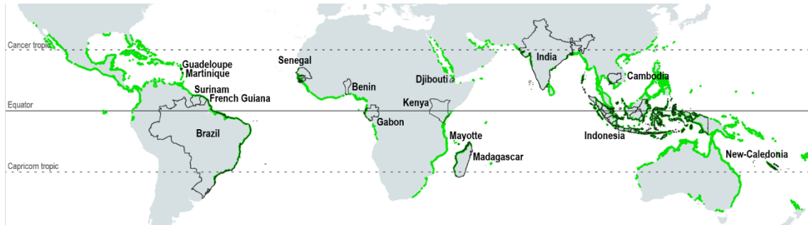
Figure 3: The platform gathers 16 pilot sites spread over South America, Africa, Asia and Oceania regions.

It is important to note that the platform administrator can adapt all the thresholds according to the geographical location (ROI raster). The user can view the raster products on the platform and download them free of charge in TIFF or JPEG format, and the vector product in SHP format. From the products created, the platform offers the user three online calculation services (Figure 1).