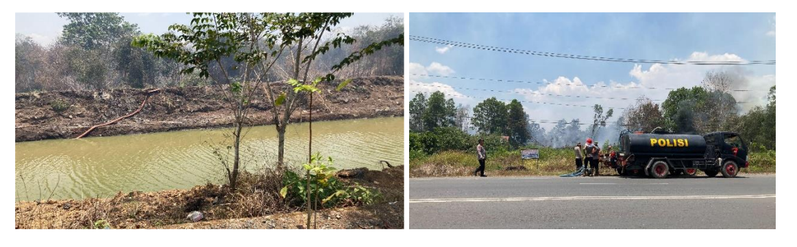
Fig. 4. Irrigation that is starting to dry

Fig. 6 show that the fire-fighting activities conducted by the volunteers of the Fire Brigade (BPK). The BPK volunteers employ various equipment, such as hoses and electric as water pumping generators functioning devices, to combat the ongoing fire. The water utilized by the volunteers is sourced from the surrounding bodies of water near the residents' vicinity. The BPK volunteers are transported via designated vehicles commonly referred to as "Pick Ups." Each BPK volunteer team comprises 5 to 6 individuals [13]. Testimonies from cooperative residents underscore the proactive nature of the BPKs in addressing the Land and Forest Fire crisis in the South Kalimantan region. Consequently, the funding for necessary facilities and infrastructure is derived from personal contributions made the volunteers bv