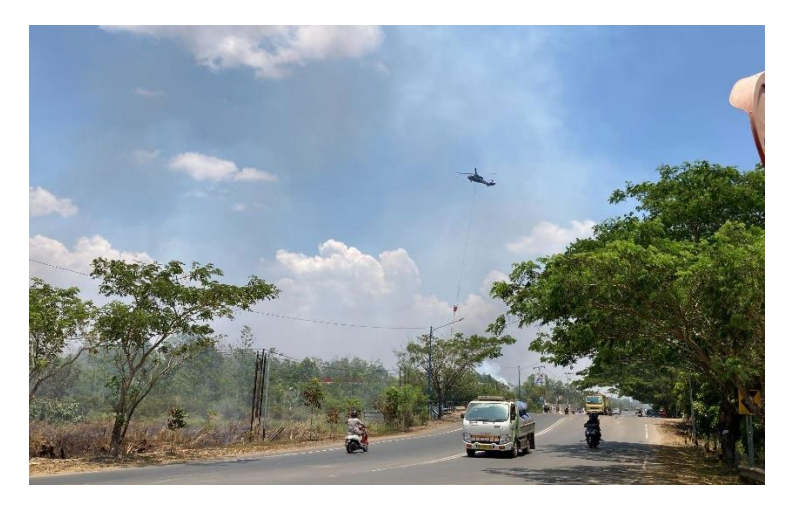
Fig. 3. Helicopters extinguishing fires at hard-to-reach points

In the course of the research, the researchers examined the activities of the Indonesian Republican Army (TNI) personnel who were stationed at the location during that period. The individual exhibited a reluctance to comply with requests for information. He contended that the dissemination of information regarding initiatives aimed at mitigating Forest and Land Fires could solely be carried out by his superior. In order to prevent researchers from obtaining information pertaining to the actions carried out by the Indonesian National Armed Forces (TNI), appropriate measures were implemented.