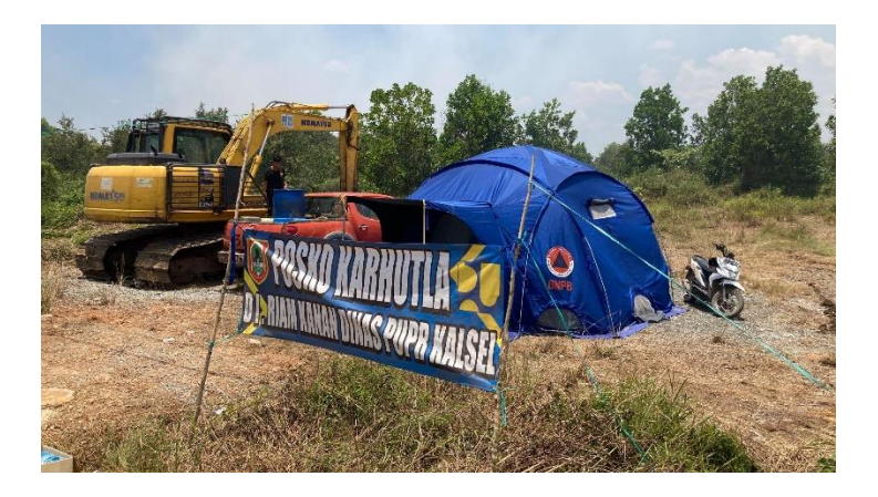
Fig. 2. PUPR command post

Waluyo et al.; Asian Res. J. Arts Soc. Sci., vol. 22, no. 10, pp. 51-62, 2024; Article no.ARJASS.117970