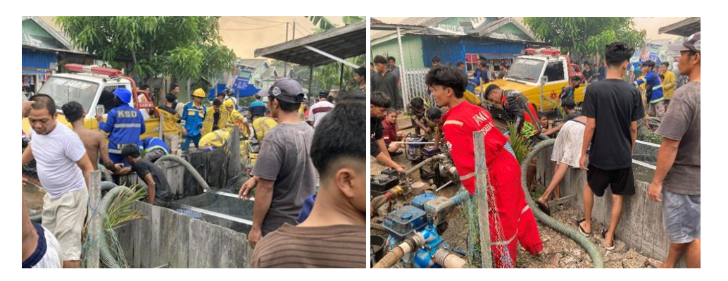
Fig. 6. Fire fighting efforts by volunteers

Waluyo et al.; Asian Res. J. Arts Soc. Sci., vol. 22, no. 10, pp. 51-62, 2024; Article no.ARJASS.117970