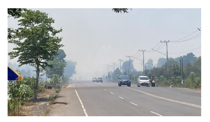
Fig. 1. JL. andil gotong royong

Fig. 2 depicts the discovery of four standby posts situated along the route, specifically designed to combat forest and land fires within the vicinity. These posts encompass the BPBD post and the Manggala post. The Agni post, the PUPR post, and the Environmental Agency post have been established in response to specific requests made during meetings, typically conveyed directly by Sahbirin Noor, the Governor of South Kalimantan. Complementing these posts is the deployment of a helicopter (Fig. 3), which serves the purpose of aerial monitoring and fire suppression in inaccessible areas.