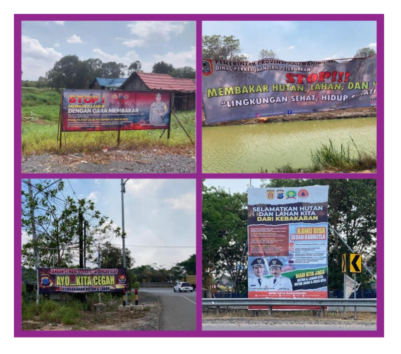
Fig. 8. Banners put up by the government related to forest and land fires

Based on the outcomes of a discussion held between researchers and a prominent figure in the online media sector in Banjarmasin city, it has been observed that the government continues to encounter challenges in effectively disseminating information pertaining to disasters. The discussion revealed that the media is still predominantly proactive, which is regrettable considering Banjarmasin's designation as a Smart City, implying integration with various applications. It is imperative that early information regarding areas susceptible to forest and land fires, such as North Banjarmasin and