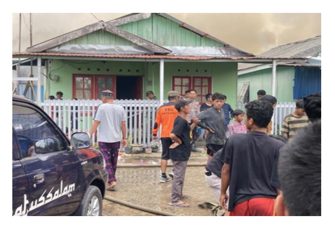
Fig. 7. Government officials at the fire site

themselves, as well as voluntary donations from local inhabitants.