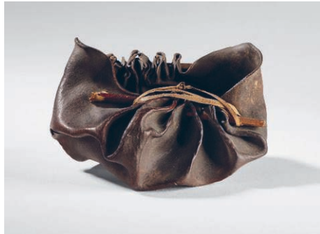
Fig. 1. – rikawa collected during the d’Entrecasteaux expedition, 1792

The baskets are not empty. They are full of makers, their stories, their thoughts while making. The baskets are never empty. All of the thoughts jump out of the baskets onto all of us. palawa artist Verna Nichols (2009)