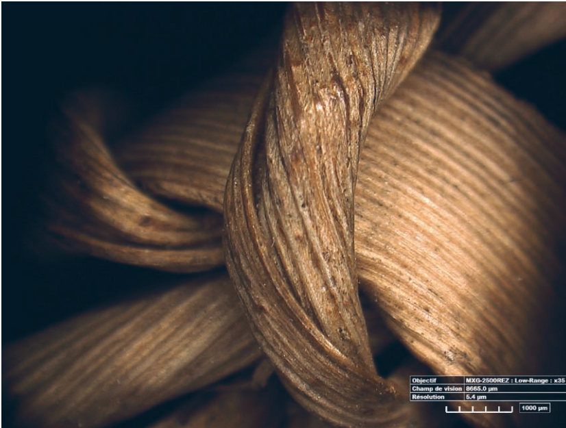
Fig. 9. – Detail of fibre handle from the British Museum rikawa through Hiox® digital microscope, April 2022