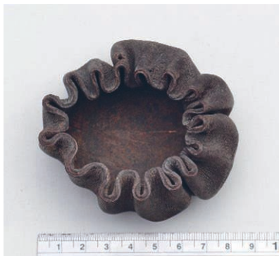
Fig. 5. – Kelp purse

Private collection Canberra, date and provenance unknown (8 cm in diameter).