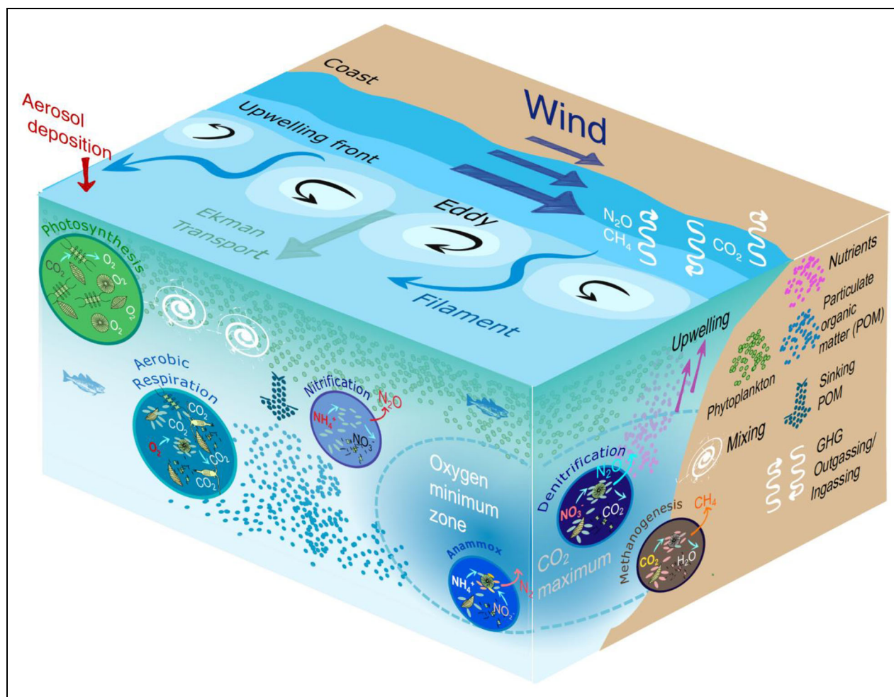
Figure 2. Overview of physical and biogeochemical processes in major coastal upwelling systems. Upwelling-favorable winds cause upwelling of nutrient-rich waters along the coast, fueling productivity in the sunlit layer. While biological carbon fixation can promote \text{CO}_2 uptake from the atmosphere, the upwelling of deep, carbon-rich waters can lead to \text{CO}_2 outgassing, especially in nearshore areas. Intense aerobic respiration results in the build-up of inorganic carbon and the depletion of oxygen at subsurface, resulting in the formation of a perennial oxygen minimum zone (OMZ) within the poorly ventilated subsurface layer, notable for its high carbon concentrations. Anaerobic respiration such as denitrification (predominantly occurring in the suboxic core of the OMZ) and methanogenesis (primarily occurring in anoxic sediments) generate potent greenhouse gases (GHG), namely \text{N}_2\text{O} and \text{CH}_4 , respectively. \text{N}_2\text{O} is also generated as a by-product of nitrification in the oxycline. The release of GHG into the atmosphere is modulated by solubility gradients driven by surface temperature, as well as by the presence of mesoscale and submesoscale eddies and filaments. Furthermore, the atmospheric deposition of nutrients, such as iron (through mineral dust deposition), can also stimulate productivity and consequently, influence the emissions of GHG into the atmosphere.

subsurface oxygen minimum zones (OMZs). However, unlike in the four eastern boundary upwelling systems where the regions of maximum oxygen deficiency are co-located with the upwelling zones along the eastern boundaries of the Atlantic and the Pacific oceans, the Arabian Sea OMZ (the world's thickest) is shifted eastward from the region of upwelling in the western Arabian Sea (Morrison et al., 1999; McCreary et al., 2013; Rixen et al., 2020; Vinayachandran et al., 2021). Beyond the differences observed among the various systems, substantial spatial heterogeneity is also evident within each major coastal upwelling system. This diversity includes variations in dynamics, seasonality, and the sources of upwelling waters between their northern and southern subregions