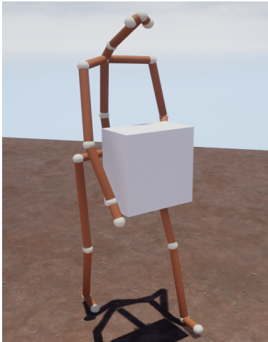
Figure 2: A 3D Avatar replaying the captured gesture, here, lifting a load.